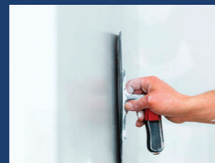
Create consistent semi-smooth finish.