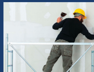
Level surface with 3-5mm KG Skim Base External.