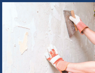
Level surface with 2-5mm KG Skim Base.