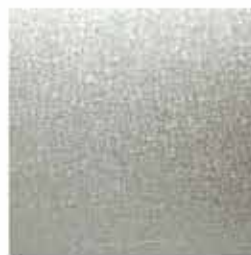
Hot-dipped Glavanised Iron (G.I)