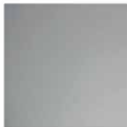
Electro Galvanised Steel (E.G)